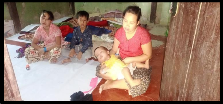
Christian family from Basatlang finding refuge in rental house in district town